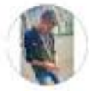
Abhishek Bindal 5 reviews · 2 photos